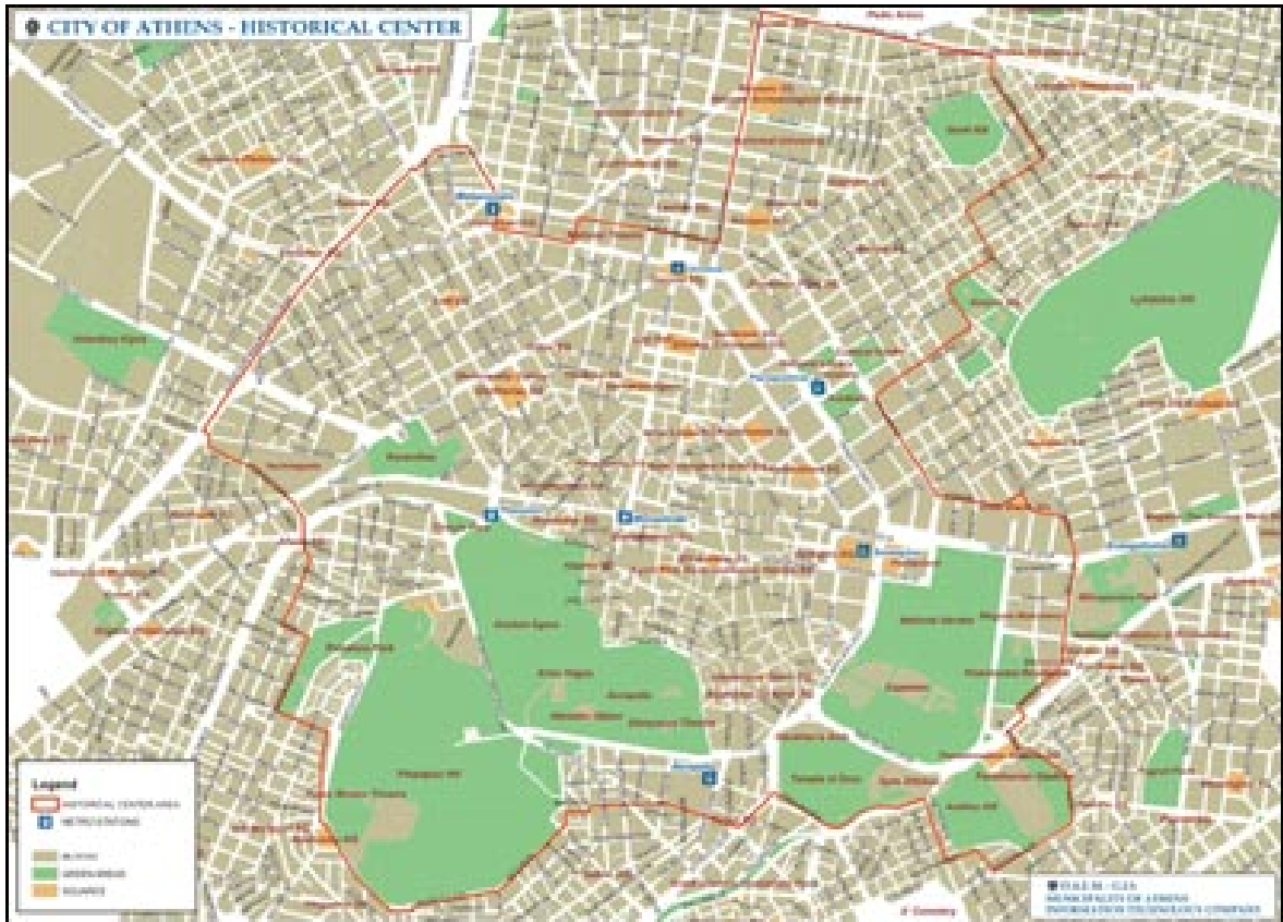
Athens City Centre