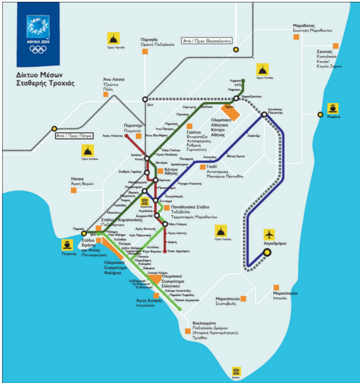
The Athens Metro Map