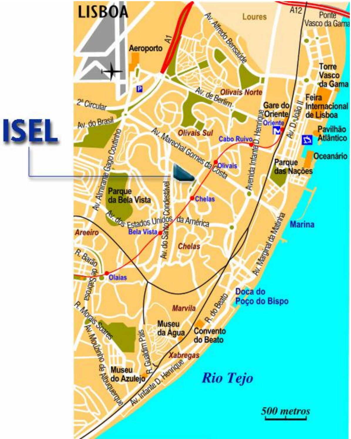
MAP OF THE EASTERN PART OF LISBON IN RELATION TO ISEL