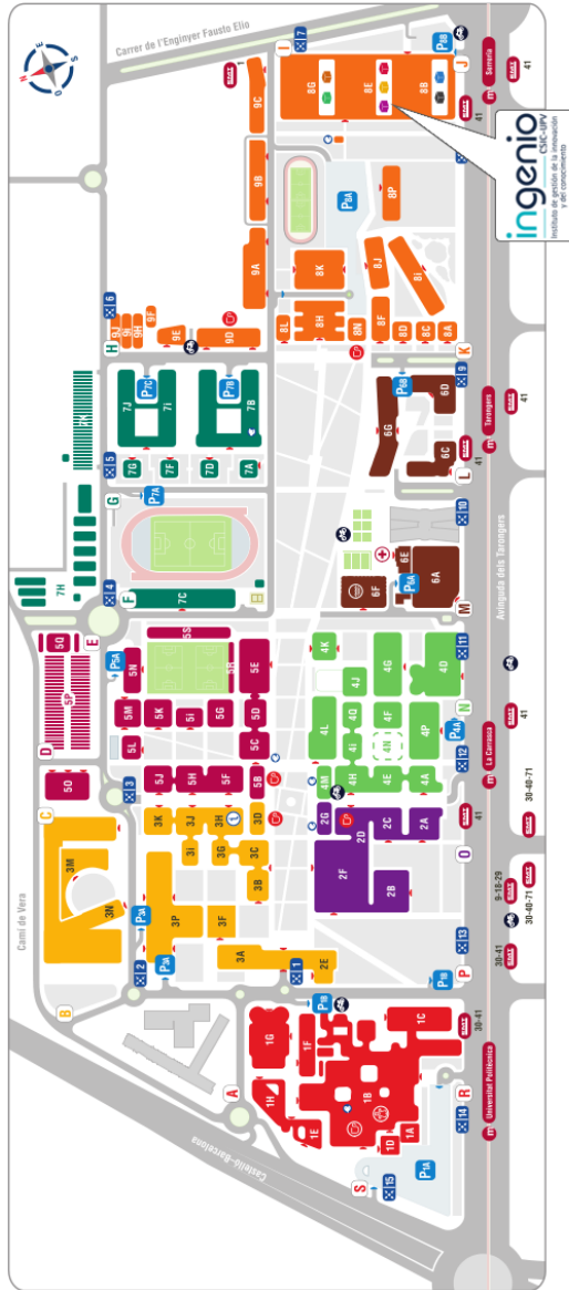
Universitat Politècnica de València Map- 8E UPV interactive map